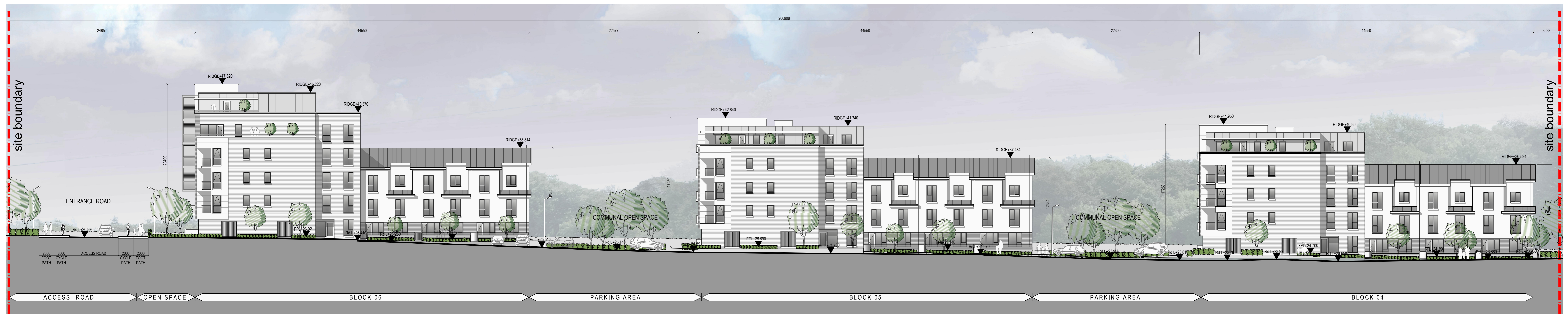
Context Elevation F-F Scale 1:200