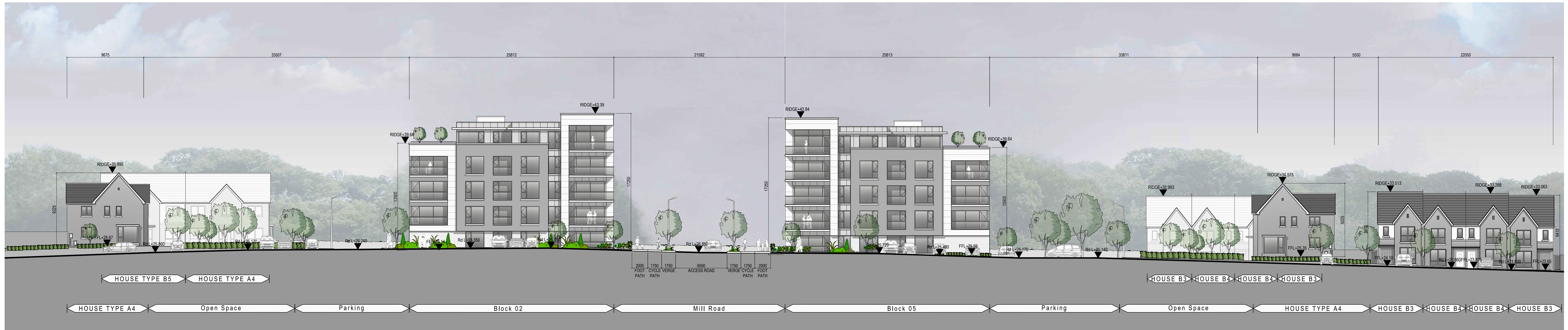
Context Elevation E-E Scale 1:200