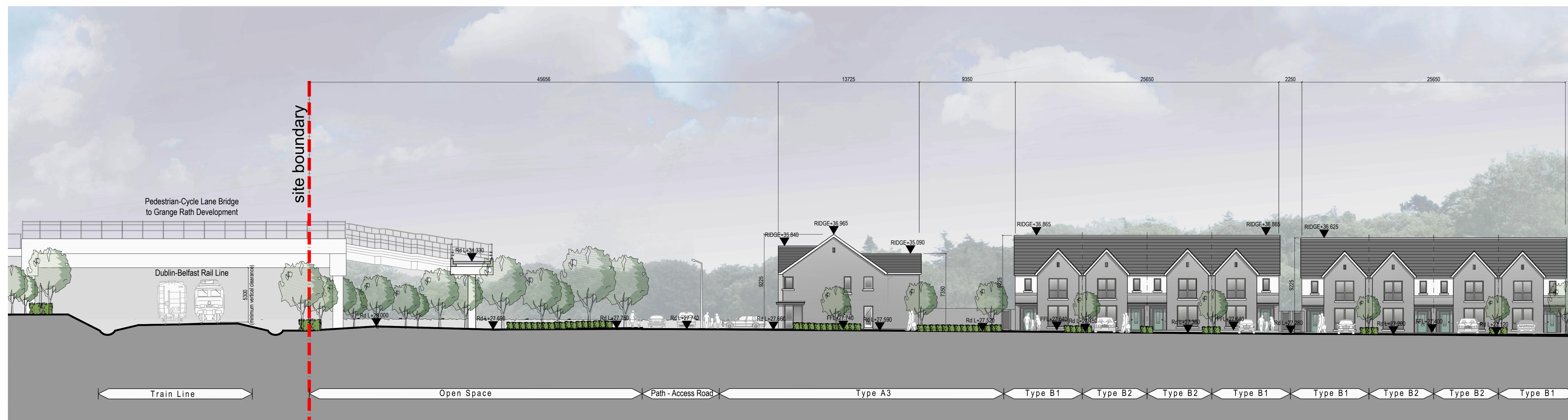
Context Elevation G-G Scale 1:200